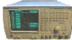
MARCONI 2955B Radio Communications Test Set